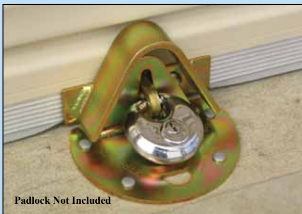
Roller Door Security Latch External XTRA-LOK

Some commercial doors lock only by the chain, leaving the door to be easily jimmied up. Others have slide bolts that are still very inadequate.