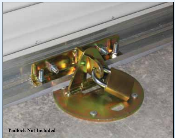
Roller Door Security Latch Internal XTRA-LOK

Double installation of XTRA-LOK's (as in the adjacent photo) have saved numerous ram-raids & break-ins, saving both insurer & business owners alike. While one XTRA-LOK in the centre of a standard 2.4m domestic roller door is usually sufficient.